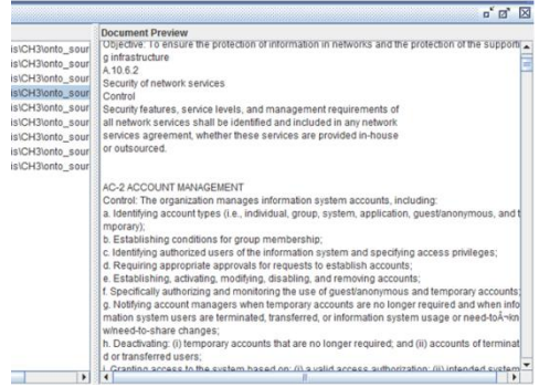
Fig. 4.Create new corpus function using KAON TextToOntoTools

We are talking about the first CA called (Retention Policy) as an example; we added the prepared text corpus (from related documents) to the tool by using the new corpus function, as shown in Fig. 4.