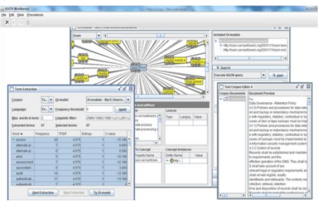
Fig. 5.New Term Extraction function using KAON TextToOntoTool

Later we used the (New Term Extraction) function in order to extract concepts from the provided text, as shown in Fig. 5.